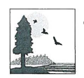
September 24, 2013

CALIFORNIA STATE LANDS COMMISSION 100 Howe Avenue, Suite 100-South Sacramento, CA 95825-8202