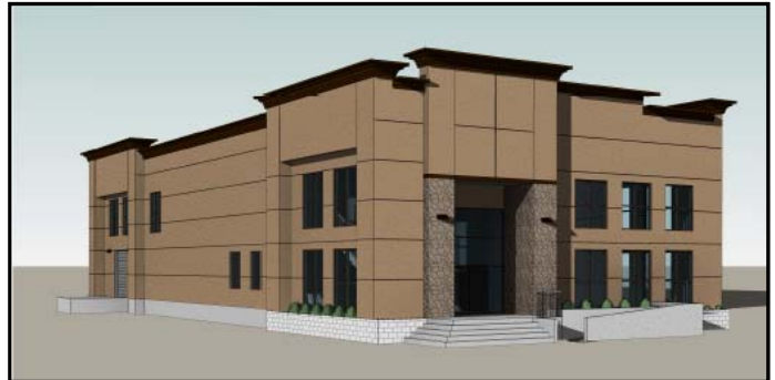
Building 3 Manufacturing, Testing Lab, Tissue Culture Facility and Research & Development