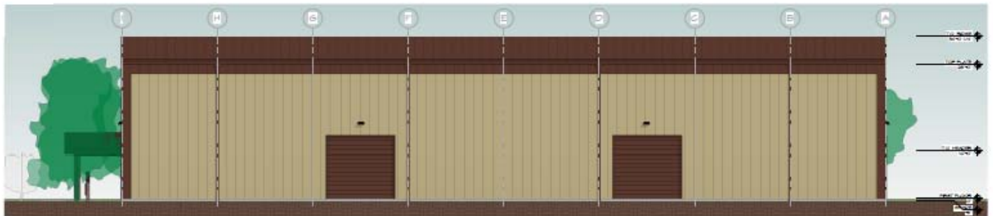
4 EAST VIEW #104