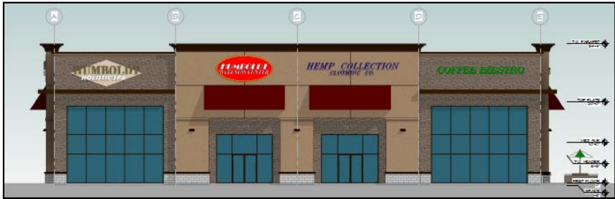
Building 1: Retail Sales Humboldt Holistic Spa & Wellness Center, Hemp Collection Clothing & Coffee Bistro