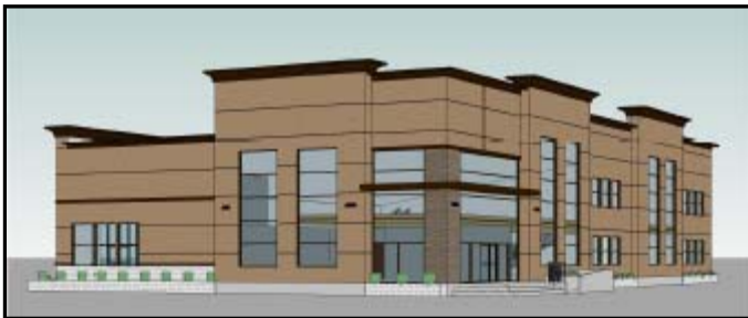
Building 2 Processing, Packaging and Distribution