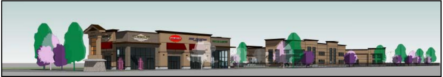
Development in progress with US 101 frontage.