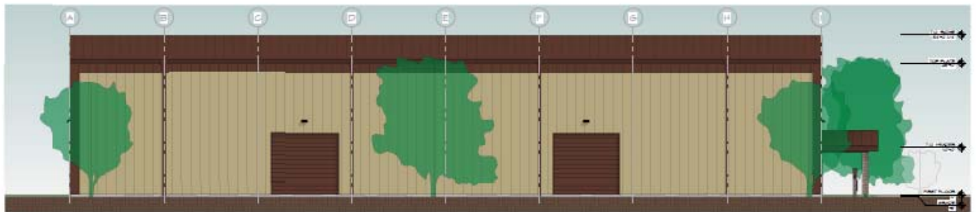
3 WEST VIEW #103