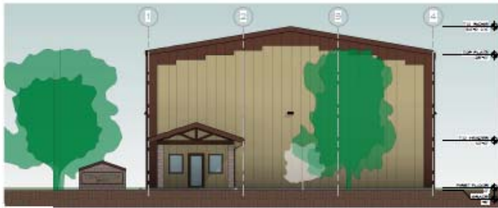
2 SOUTH VIEW #102