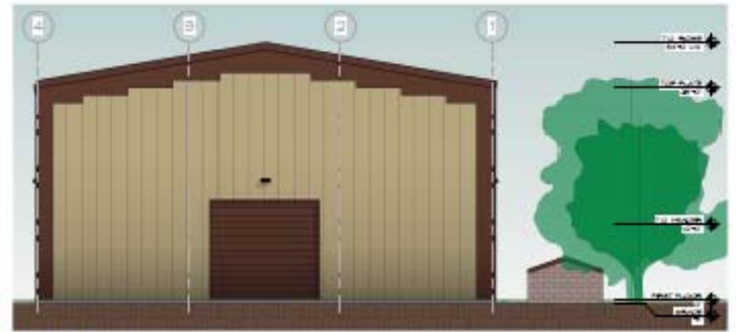
1 NORTH VIEW #101