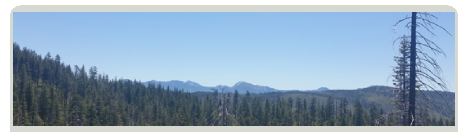
President's Message July 2016