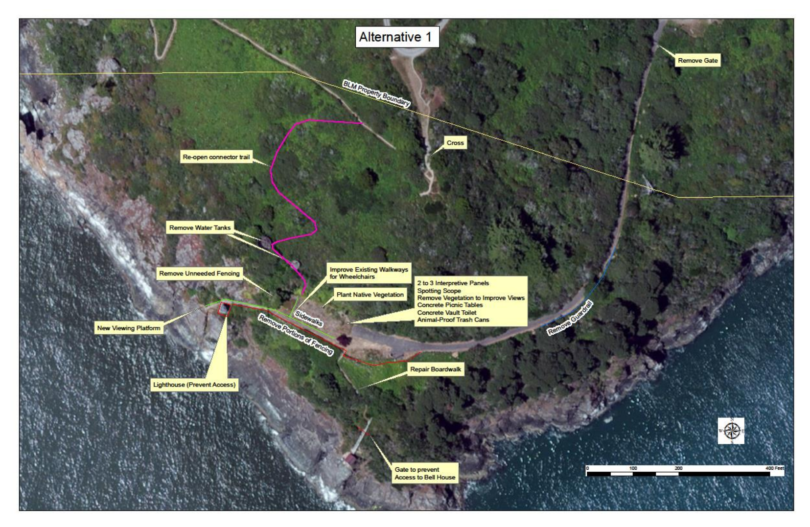
Figure 4. Aerial photograph showing proposed changes to Trinidad Lighthouse site under Alternative 1.