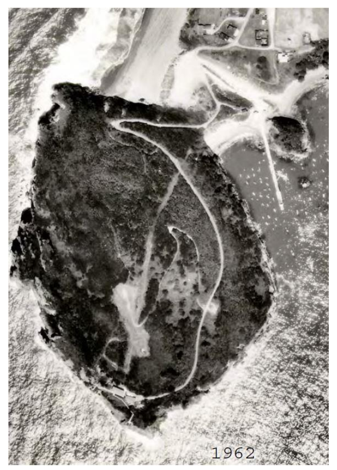
Figure 5. 1962 Aerial photograph of Trinidad Head showing connector trail from Lighthouse site to existing routes.