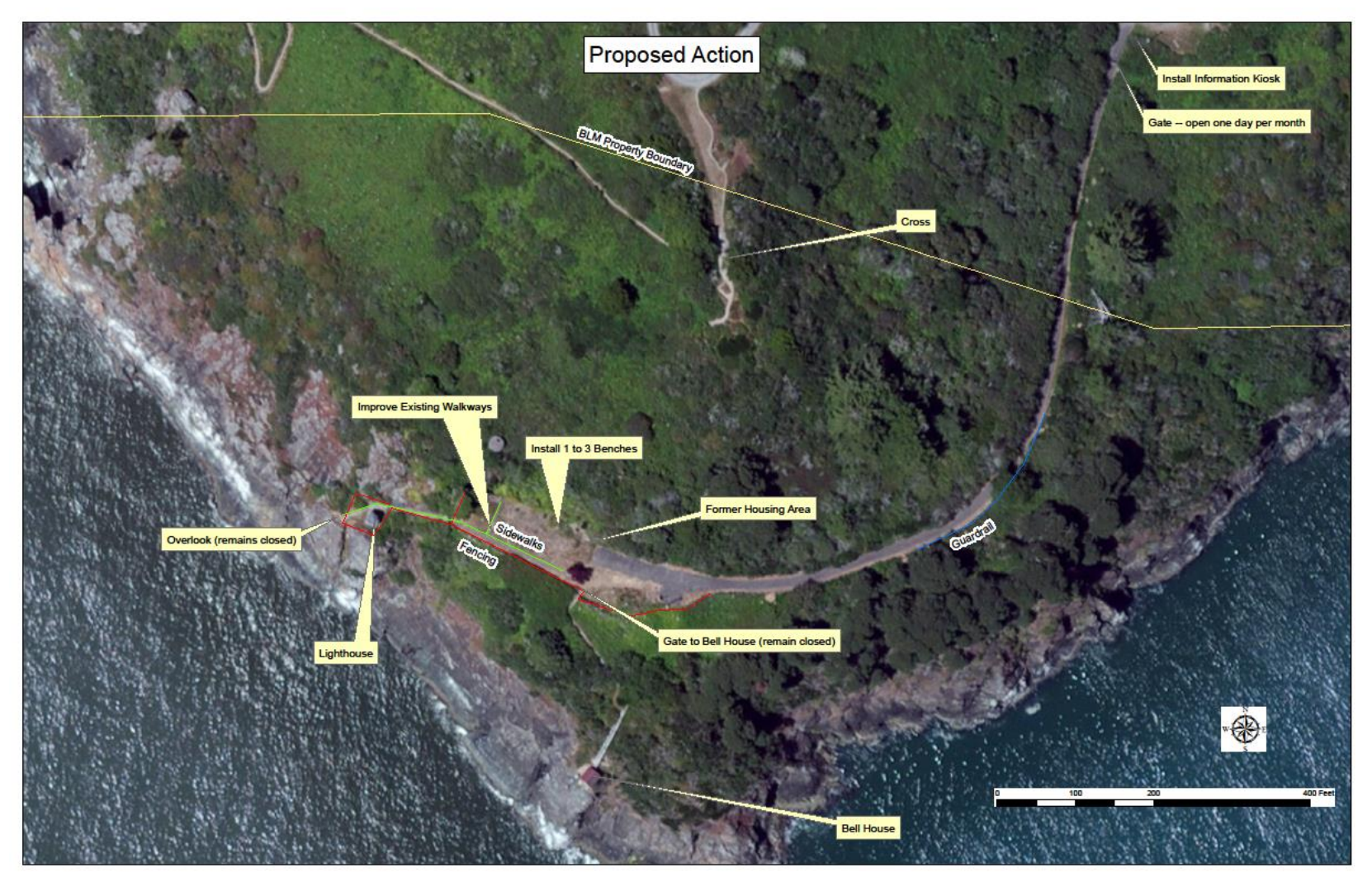
Figure 3. Aerial photograph showing proposed changes to Trinidad Lighthouse site under the proposed action.