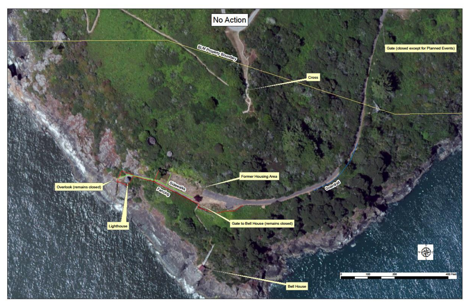
Figure 6 Aerial photograph showing conditions at the Trinidad Lighthouse site under the No Action Alternative.